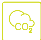
Less CO2 Emissions