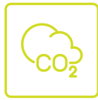
Less CO2 Emissions